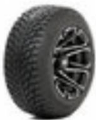
Normal Golf Tire