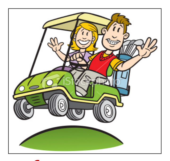
July 17 & 24, 2018 Lunch included on the 24^{th}